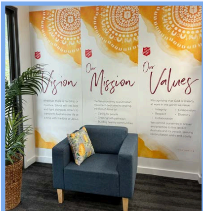
Wow! Student Reception has had a bit of a facelift!